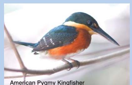
American Pygmy Kingfisher

tall trees, and find some of the colourful frogs and butterflies that have made this area the most famous in Costa Rica. Many species of hummingbird can be found taking nectar from the flowers, and we can hope to find Green Violetear, Steely-vented, Rufous-tailed and Striped-tailed Hummingbirds, as well as Purple-throated Mountain-gem, Green-crowned Brilliant and Magenta-throated Woodstar. We will also look for Black Guan, Prong-billed Barbet, Orange-bellied Trogon, and much more. The time here will be very exciting, as there is so much to see!