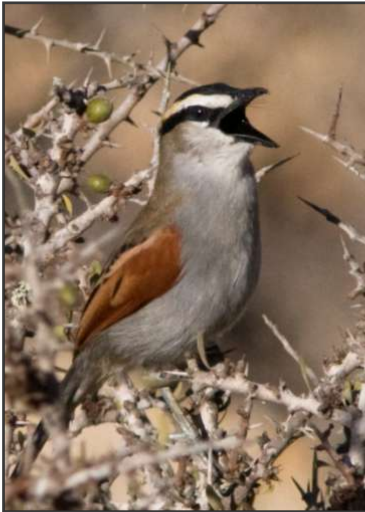
Black-crowned Tchagra, Kasbah