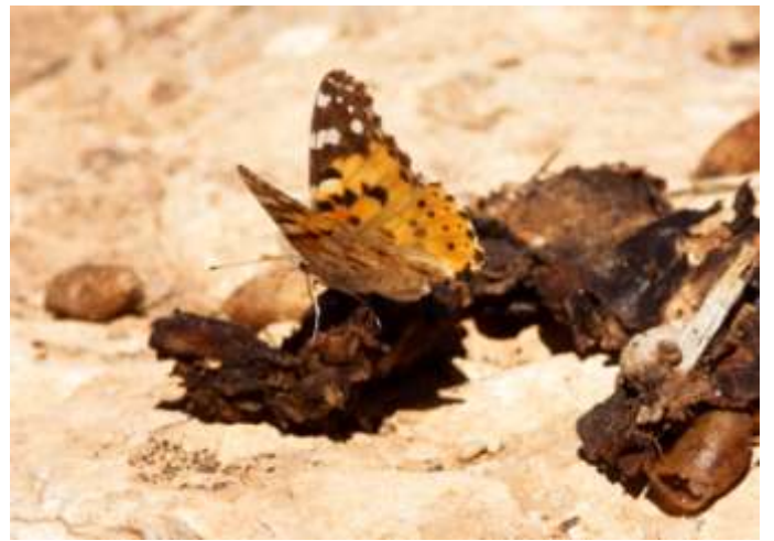
Painted Lady feeding on rotting dates